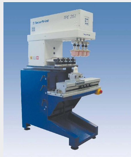
The all NEW TPE 251

The all new E2-Series of pad printing machines are an innovative new development from Teca-Print with an incredibly wide range of uses. This series of pad printing machines possess the ability to deliver high printing pressure for those